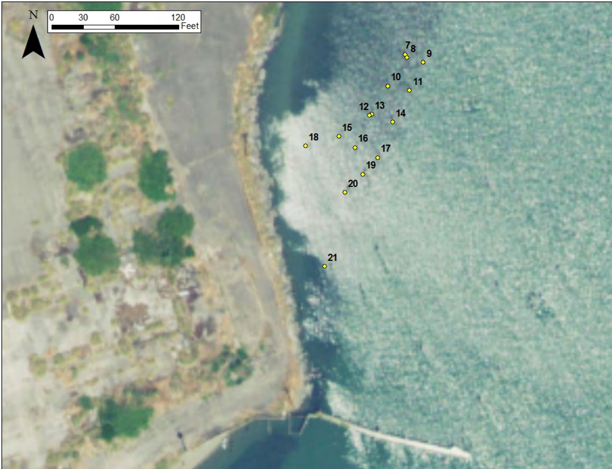
Figure 5. Southern set of piles proposed for removal.