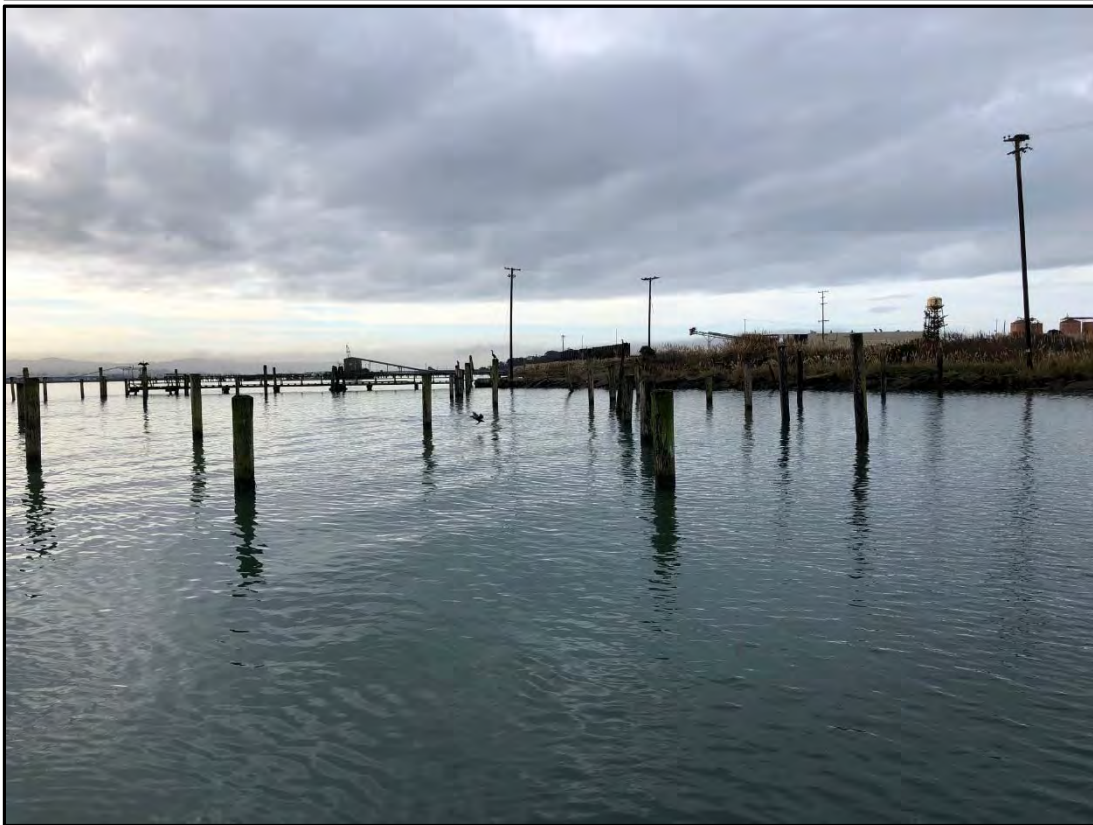
Figure 4. Representative photos of northern set of piles proposed for removal.