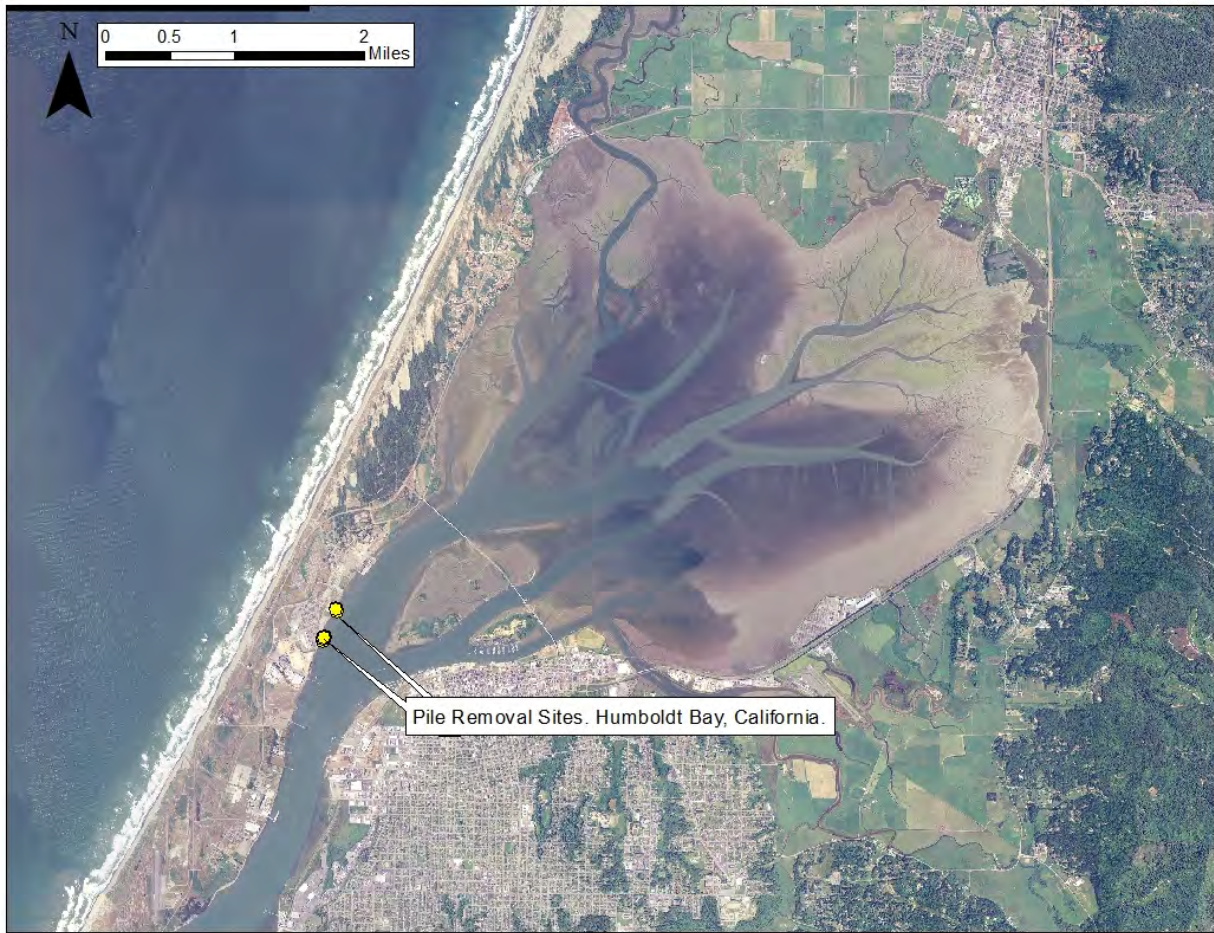
Figure 1. Location of piles proposed for removal.

Figures 1-6 show the location of the 21 piles proposed for removal and representative photos. The piles appear to be in relatively good condition (e.g., there are no signs of substantial rotting) and it's expected that they can be removed without breaking off. Table 1 presents the geographic coordinates of the piles. Upon completion of the pile removal activities, a report will be provided to California Coastal Commission staff describing the process. The report will describe the duration of pile removal activities, whether piles broke off and if so the replacement piles that were removed, pile transportation and storage, and other relevant details of the removal activities.