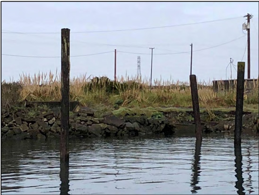
Figure 6. Representative photos of southern set of piles proposed for removal.