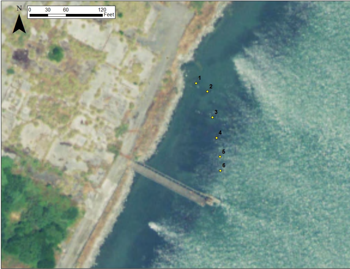
Figure 3. Northern set of piles proposed for removal.