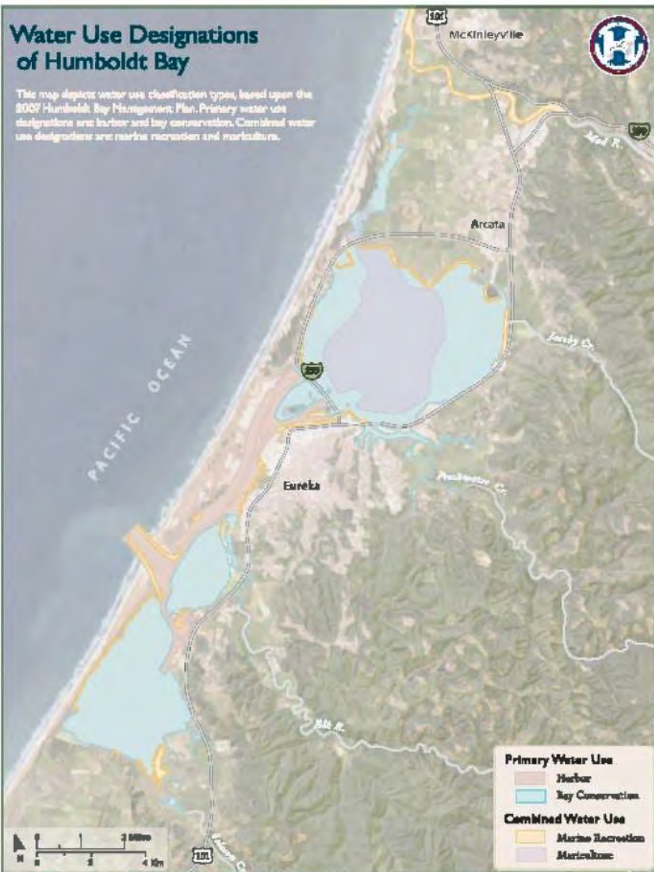
Figure 2-1: Humboldt Bay Water Use Designations