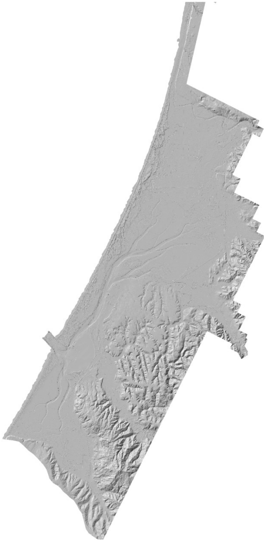
Figure 2. Hillshade of the Humboldt Bay SLR Vulnerability Assessment project DEM.