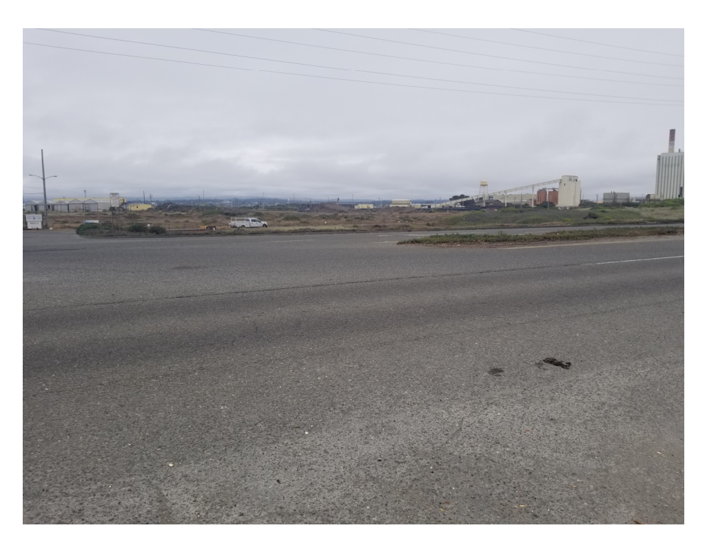
View of the Sierra Pacific Saw Mill