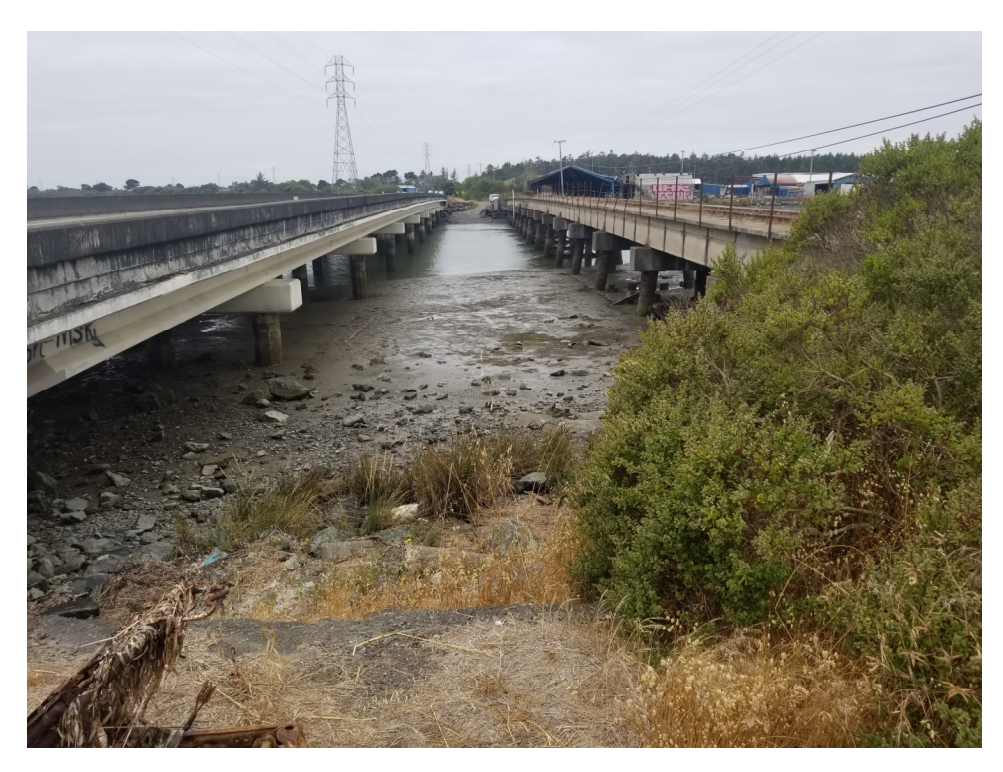
View of the Mad River Slough from the east looking towards the west (Caltrans Bridge to the left, Railroad Bridge to the right)