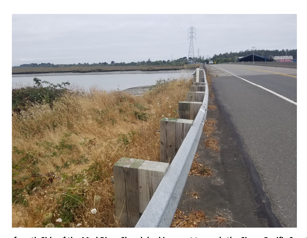
View of south Side of the Mad River Slough looking west towards the Sierra Pacific Saw Mill