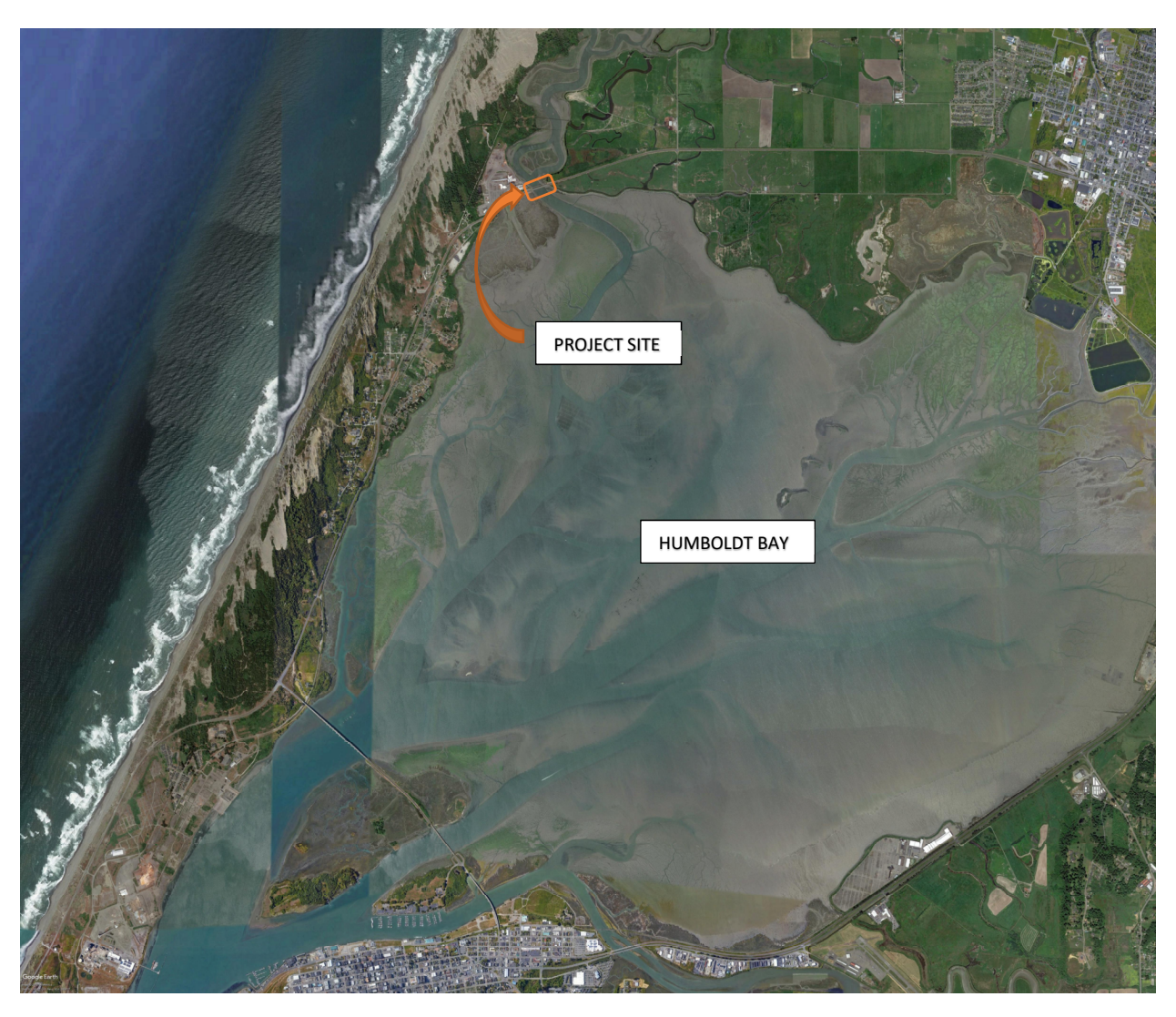
Humboldt Bay/Project Vicinity map