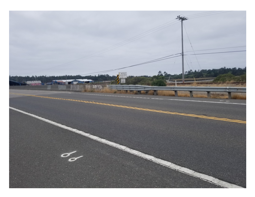
View of south Side of the Mad River Slough looking west towards the Sierra Pacific Saw Mill